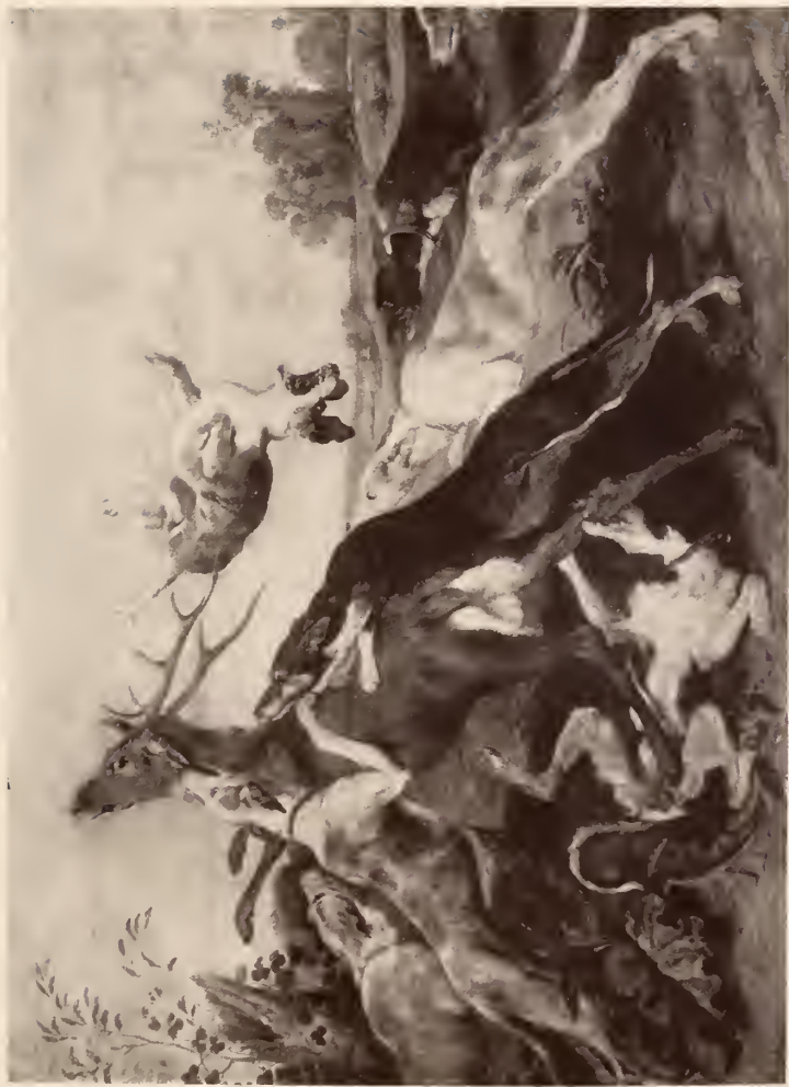
No. 62. DOGS ATTACKING A STAG By Frans Snyders